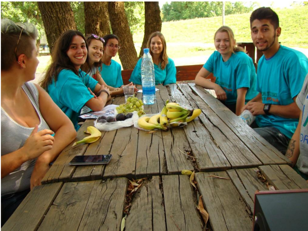
Our local and EVS volunteers on Info centre activities, August 2017.

With every EVS project we are promoting the values of volunteering, active citizenship, non-formal education and multiculturalism. Promoting human rights, solidarity, and tolerance is important for development of post war communities like Petrinja.